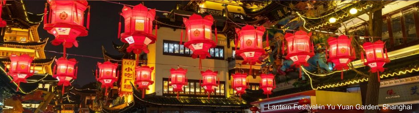
Lantern Festival in Yu Yuan Garden, Shanghai