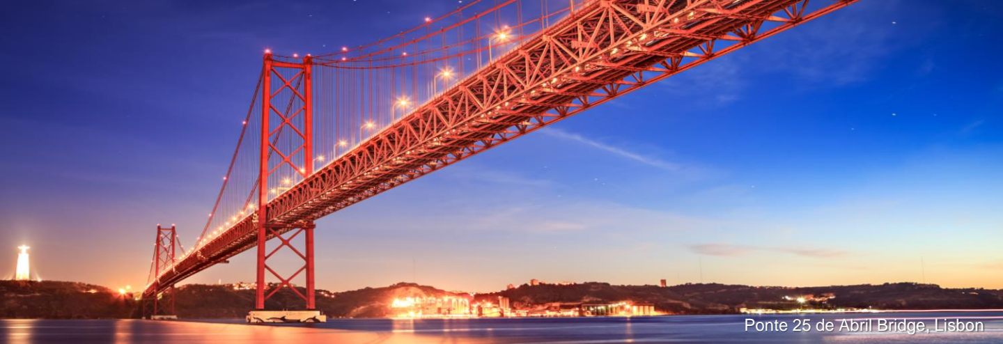
Ponte 25 de Abril Bridge, Lisbon